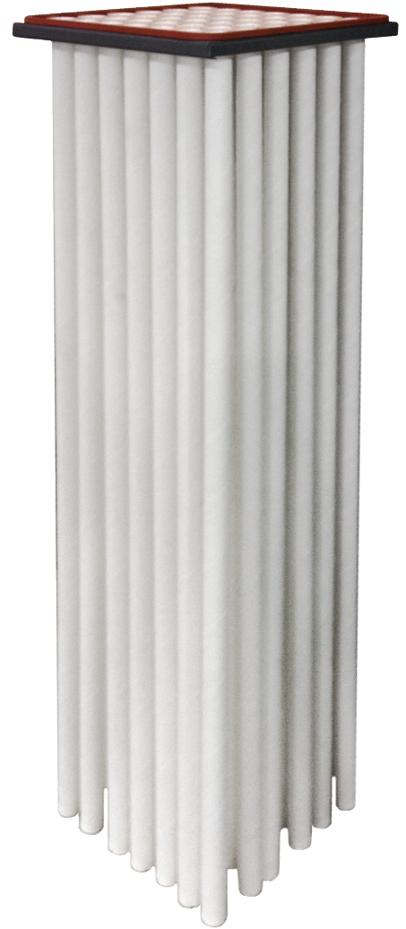
HELIX TUBE CASSETTE